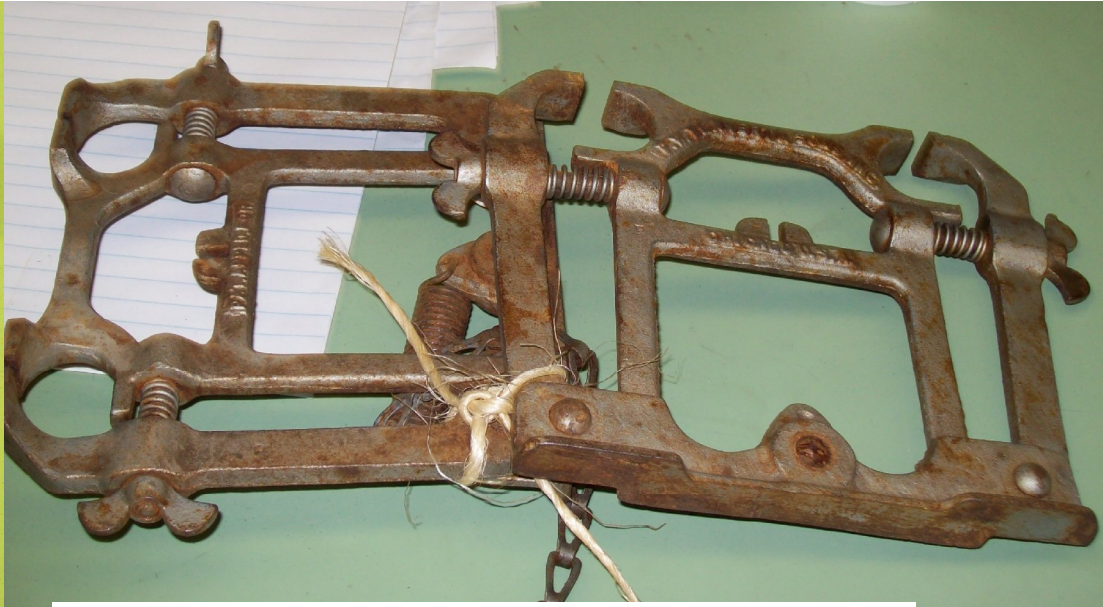
Joe Pietsch's ice skate sharpener or medieval torture device?